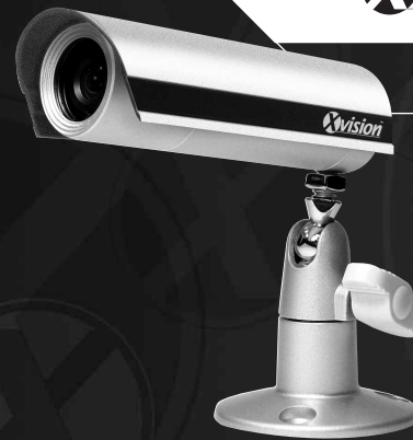
Model: VIS200E Colour Internal/External Bullet Camera