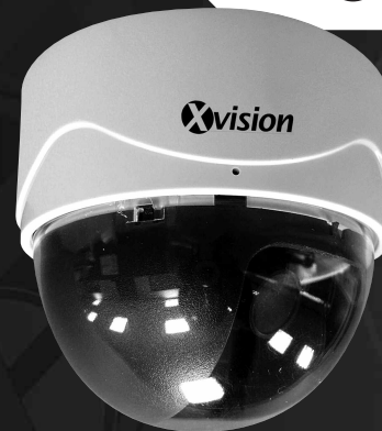
Model: VIS200DE Colour Internal Dome Camera

Manufactured exclusively for: Xvision (Europe) Group , Head Office: London, U.K. Email: info@x-vision.co.uk Web: www.x-vision.co.uk