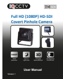
1x User Manual