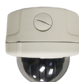
Camera - Rear