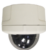
Camera - Front

The Vandal Resistant construction, makes it ideal for use in areas where the camera may be subject to tampering or vandalism.