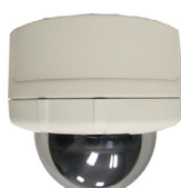
Camera - Side