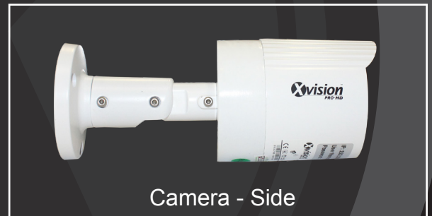
Camera - Side

The XC1080BP offers 2 mega pixel Full HD (1080P) resolution in a weatherproof and resilient bullet enclosure. The camera features a high quality 3.6mm lens for 78° viewing angle and high power IR LEDs for up to 30m IR night vision.