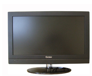
Monitor - Front

The X19LED is equipped with a HDMI connection for a clearer picture as well as a BNC, Phono and VGA connection. The monitor is also fully VESA compliant for versatile fitting and is designed for indoor use in both domestic and commercial premises.