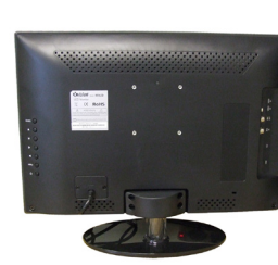
Monitor - Back