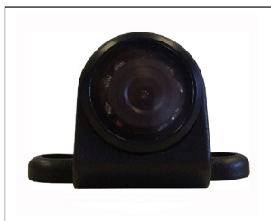
Camera - Front