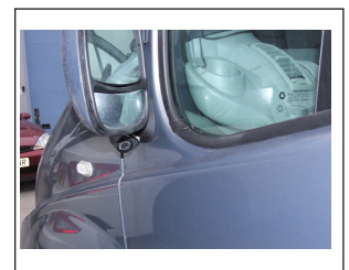
Camera - Location