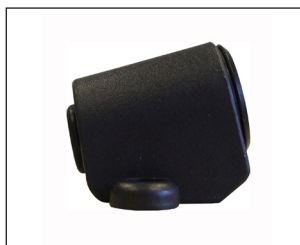
Camera - Side