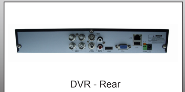
DVR - Rear

The IQR960D4 4 channel DVR is the latest from IQCCCTV and offers High Definition 960H real time recording. The DVR presents great value for money and has both VGA and HDMI outputs.